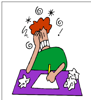
Hopefully we'll be able to help you out with all those assignments so you never look like this!

Well, we hope you have a lot of fun hanging out with us and maybe get some HW done too.